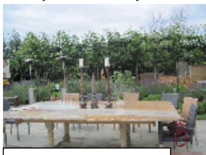
The table in the garden