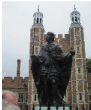
Henry VI statue in School Yard

The route to the next Memorial took us through the woodland and meadows of Cooper’s Hill with views down to the River Thames. After a short refreshment break we walked between stone pillars towards the striking building of the Air Forces Memorial. It’s hilltop position seemed appropriate for those who spent their lives in the skies. Beneath the figure of an eagle with outstretched wings is inscribed the RAF motto which, translated, reads ‘Through Hardship to the Stars’. Thoughtfully, we walked within cloisters where are recorded the names of 20,456 members of the Allied Forces who died during World War 11 but have no known grave. Giving the impression of partly opened stone books, the ‘pages’ seemed endless. At each end the cloisters curve outwards like wings, ending in look-out points for a view across the valley. For those who wished to climb the spiral stairs, a gallery above gave an even better view. Further steps led up to the roof where a 360 degree view took in Windsor Castle, River Thames, Heathrow Airport, and the Fairhaven Memorial Lodges where our walk had begun. We read from the Queen’s speech, made upon her opening the Memorial in 1953, ‘the men and women who possess it (freedom) will thank them and will say they did not die in vain’. We signed the Visitor Book and left to walk freely within the waving grasses of Runnymede Meadows, passing Langham Pond, a SSSI. Soon we reached the Thames to walk beside its reflective surface, rippled by boats and waterfowl.