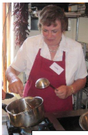
Making Spun Sugar Baskets

The morning was spent making bread, preparing a cake base for a cheesecake and a risotto to use later. We also used ring moulds to form attractive salad towers topped with pancetta & quail's eggs. A round loaf of bread was presented to us and, once the top had been cut off, inside was revealed a melted camembert cheese. This was eagerly devoured for lunch! In the afternoon the topping for the cheesecake was made and fresh fruits mulled to accompany it. We each boned a plump chicken leg and stuffed it with the risotto prepared earlier, and made potato latkes topped with smoked salmon. Taking a break back out in the sunny garden, we found welcome jugs of Pimms awaiting us. The range had been working overtime and our break gave the chance for the large gas bottle fuelling it to be changed. This took longer than expected but we didn't mind a bit, especially as the jugs of Pimms had been replenished! Back in the kitchen we set about making tarte tatin. Left-over caramel gave me the opportunity to attempt something I've long fancied trying – making a spun sugar basket just like James Martin!